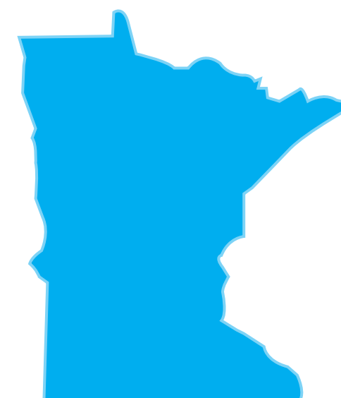
FIGURE 5: MINNESOTA ECONOMIC IMPACTS OF INVESTING IN CLEAN ENERGY GENERATION

Source: Regional Economics Applications Laboratory.